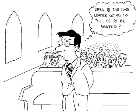
The perils of front-row worship

Annual Meeting January 29, 2023 11:30 a.m. in the sanctuary