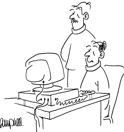
Remember when we could count our blessings without a spreadsheet program?"

Needed this month: peanut butter, jam, pudding, boxed meals (Hamburger/Tuna Helper), Chef Boyardee canned meals, canned pork & beans, Raman noodles, boxed potato flakes, canned soup, and cereal. Paper and plastic bags are always in need for packaging.