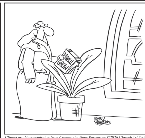
Clipart used by permission from Communications Resources ©2026 ChurchArt Online