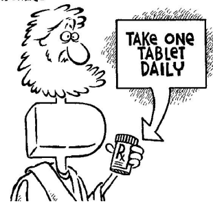
MOSES MISUNDERSTANDS HIS DOCTOR'S ORDERS