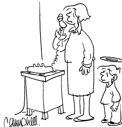
"He's just not himself, doctor."

The Youth appreciate your donations—which must be bagged —as an ongoing fund raiser.