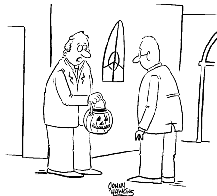
"I'm not real comfortable with using these as offering plates during our harvest celebration service."