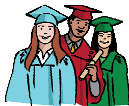
Our High School Graduates