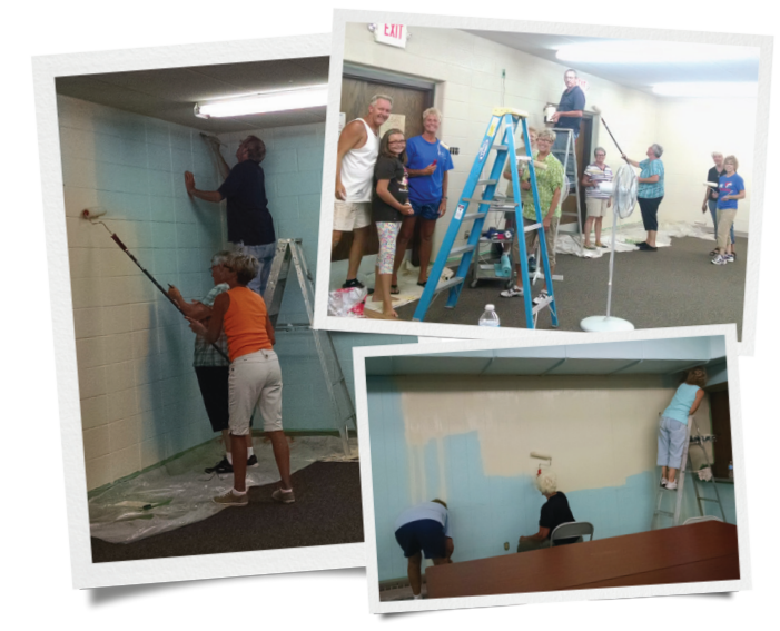
This renovation project will offer more chances for Zion members to volunteer!

Zion Lutheran Church members need to come together after Zion's long transition period. We can work together and make our church environment more welcoming to members, people looking for a church home, and visitors. Lets celebrate this time by approving an updated sanctuary to pray, sing, and worship.