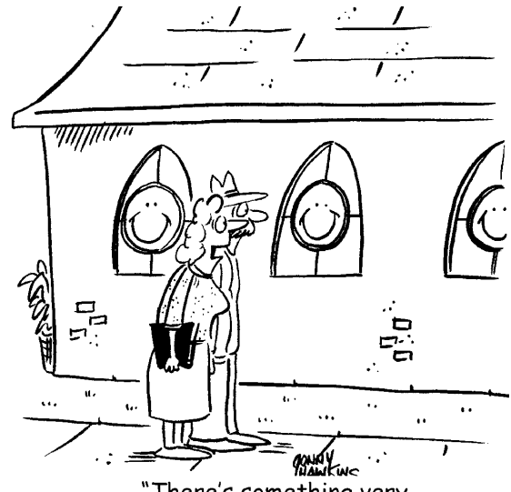
"There's something very positive about this church".

Volunteers needed! Please sign up online or contact the office. Thank you!