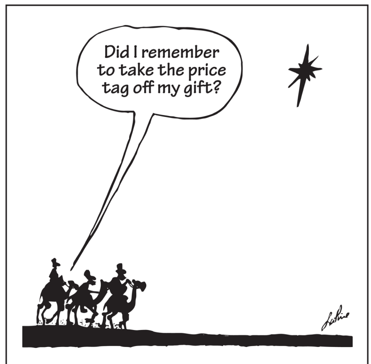
Clipart used by permission from Communications Resources ©2023 ChurchArt Online