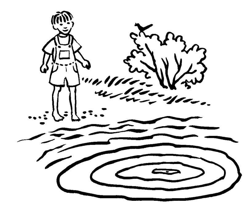
Color one ripple of water each time you pray, "Lord, have mercy."

Welcome to worship. In worship we say or sing the prayer "Lord, have mercy." Every time we pray, "Lord, have mercy," our prayers ripple out farther and farther. We pray for ourselves, our neighbors with us at worship, and our neighbors in all parts of the world.